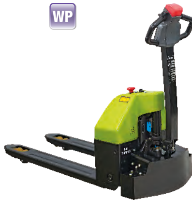
WP15 2x12 VOLT PALLET TRUCK 1500 kg