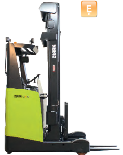
SRX14/16 48 VOLT REACH TRUCK 1400 1600 kg