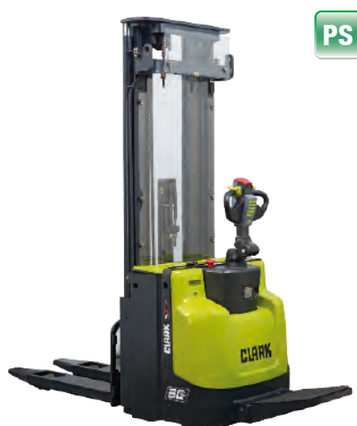
SX12/16 24 VOLT PALLET STACKER - PLATFORM VERSION 1200 1600 kg