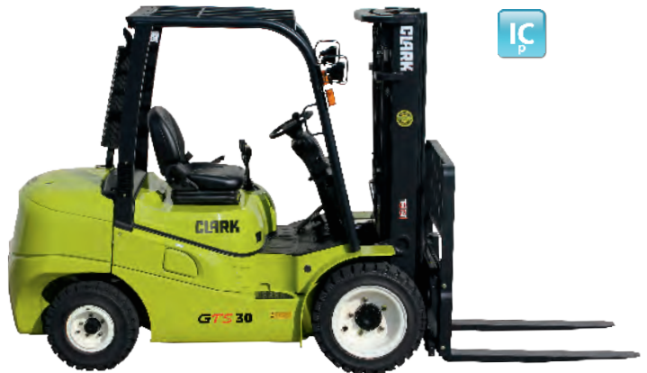
GTS20/25/30/33 LPG/DIESEL 20 25 30 33 2000 2500 3000 3300 kg