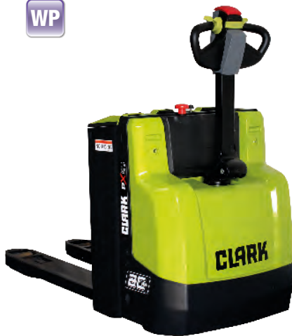
PX20 24 VOLT PALLET TRUCK 2000 kg