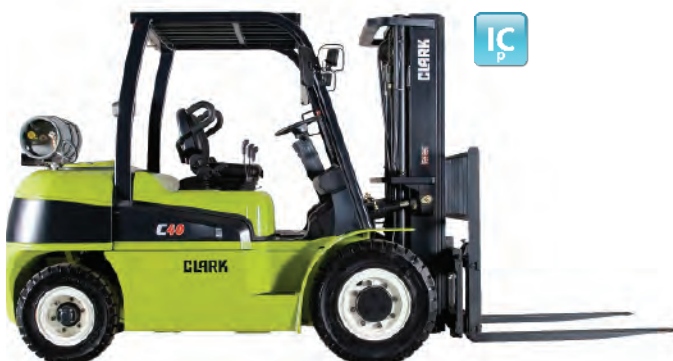
C40/45/50s/55s LPG/DIESEL 40 45 50s 55s 4000 4500 5000 5500 kg