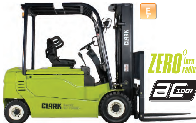
GEX20/25/30/30s/30L 4-WHEEL 80 VOLT

20 25 30s 30 30L 2000 2500 3000 3000 3000 kg