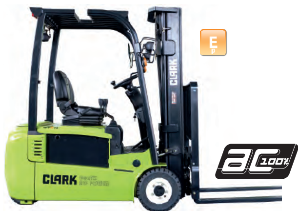
GTX16/18/20s 3-WHEEL 48 VOLT