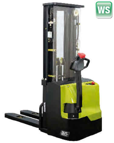
WSX12/14 24 VOLT PALLET STACKER 1200 kg 1400 kg