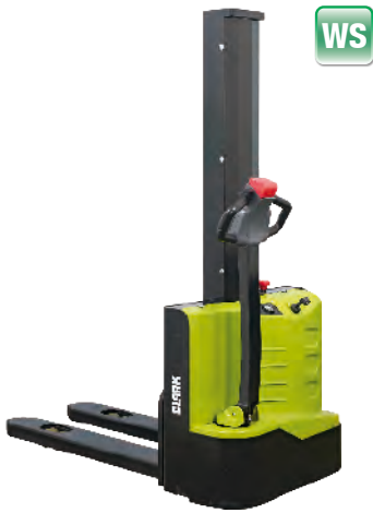
WS10M 2x12 VOLT PALLET STACKER 1000 kg