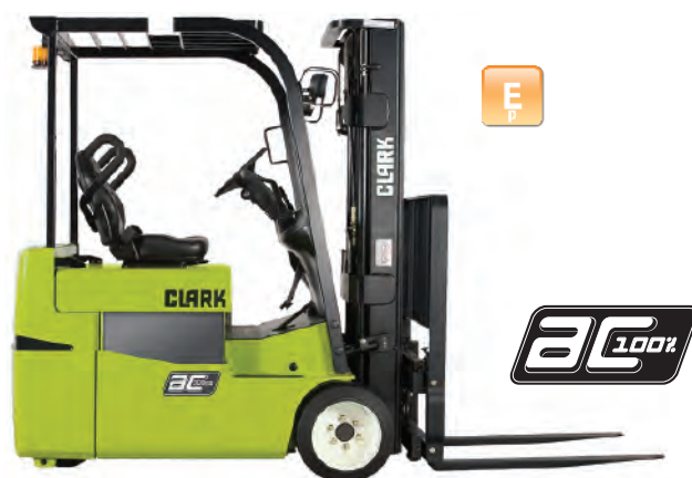
TMX13/15s/15/18/20x 3-WHEEL 48 VOLT

13 15s 15 18 20x 1250 1500 1500 1800 2000 kg