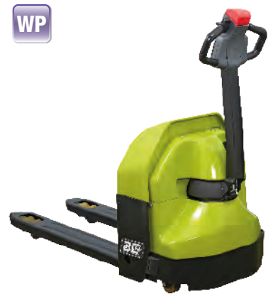
WPX18 2x12 VOLT PALLET TRUCK 1800 kg