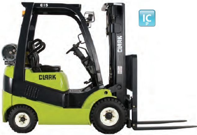
C15/18/20s LPG/DIESEL 15 18 20s 1500 1800 2000 kg