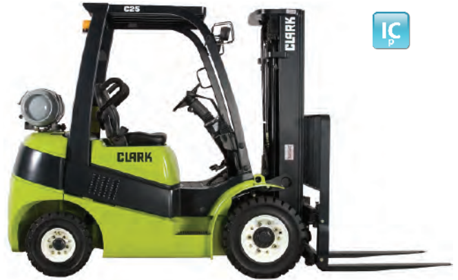
C20/25/30/35 LPG/DIESEL 20 25 30 35 2000 2500 3000 3500 kg