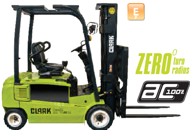
GEX16/18/20s 4-WHEEL 48 VOLT