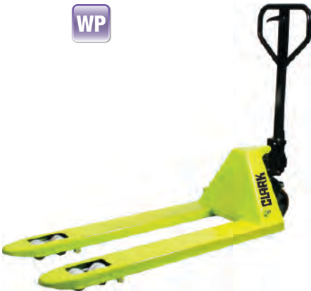
CLARK HAND PALLET TRUCK 2500 kg