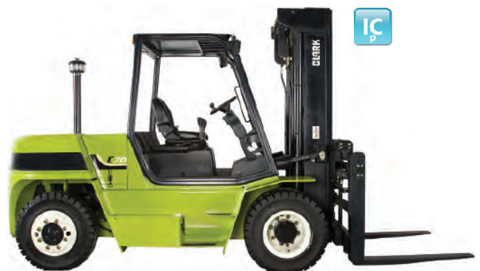
C60/70/75/80 LPG/DIESEL 60 70 75 80 6000 7000 7500 8000 kg