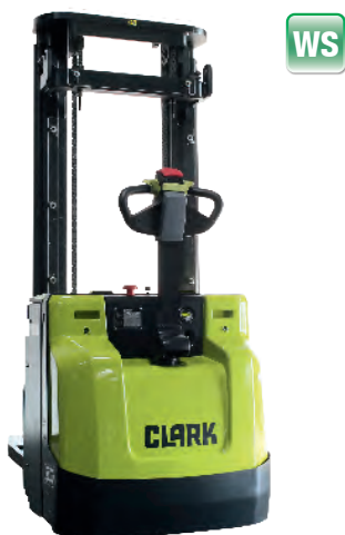
SX 12/16 24 VOLT PALLET STACKER 1200 1600 kg