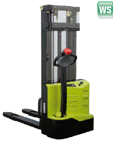
WS10 2x12 VOLT PALLET STACKER 1000 kg