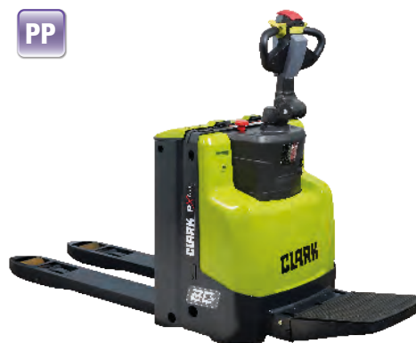
PX20 24 VOLT PALLET TRUCK - PLATFORM VERSION 2000 kg