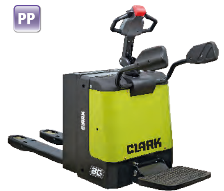
PPX(S)20 24 VOLT PALLET TRUCK 2000 kg