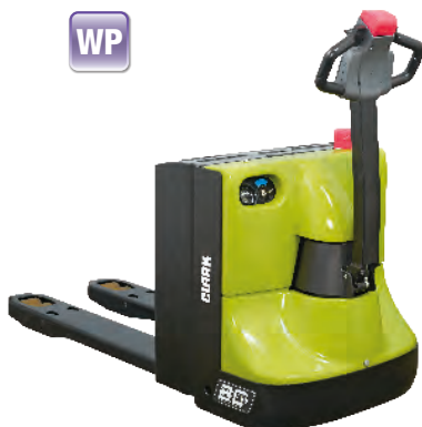
WPX20 24 VOLT PALLET TRUCK 2000 kg