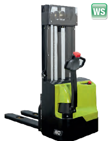
WSXD20 24 VOLT PALLET STACKER - MULTI-PURPOSE TRUCK 2000 kg