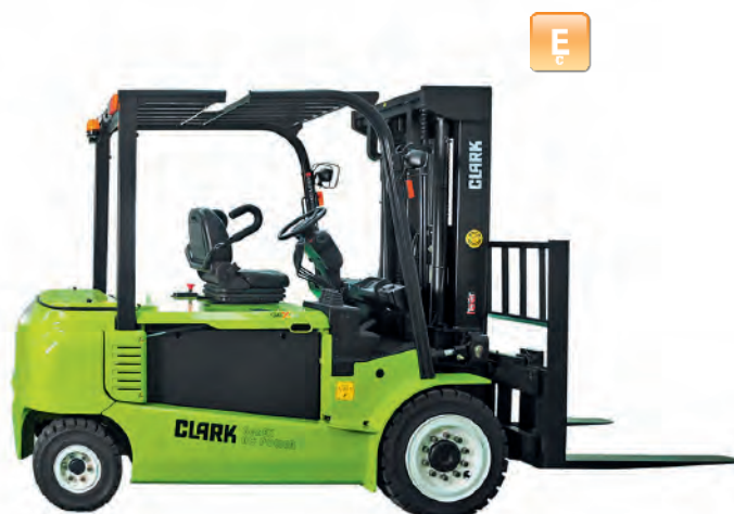
GEX40/45/50 4-WHEEL 80 VOLT