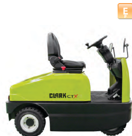
CTX40/70 3-WHEEL 48 VOLT

13 15s 15 18 20x 1250 1500 1500 1800 2000 kg