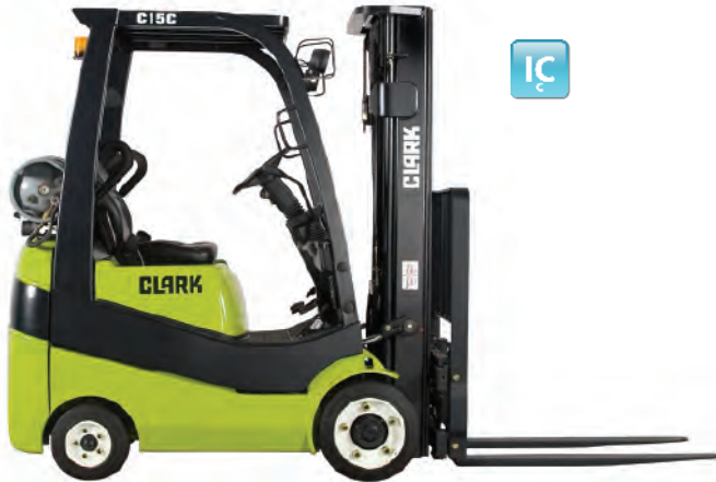
C15C/18C/20sC LPG C20C/25C/30C/32C LPG 15 18 20 25 30 32 1500 1800 2000 2500 3000 3200 kg